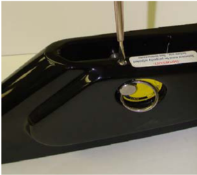
3. Screw Ball Plunger all the way down by turning clockwise until it stops.