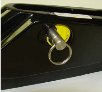
1. Lower tower to a position to allow the free inserting of Locking Pin .