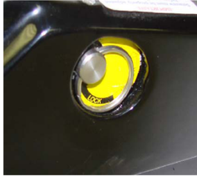
2. Insert Locking Pin all the way into lower base.