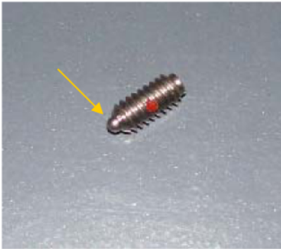
7. If you suspect Ball Plunger is not holding Locking Pin correctly, it will be necessary to remove Ball Plunger and inspect working end of Plunger .